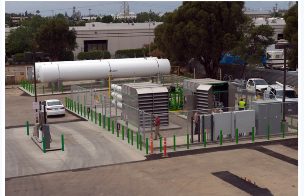
Ariel View of Fueling Island and RNG Storage