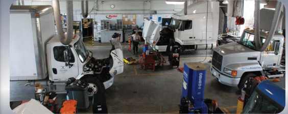
Maintenance and Roadside Service