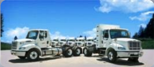
Alternative Fuel Fleets