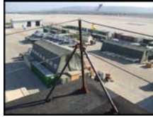
Cable perimeter safety system