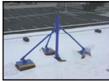
Anchored tripod to support cable on fall protection system