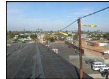
Safety poles supporting cable fall protection system