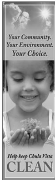
Chula Vista Clean Logo